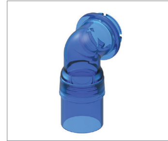
Nonvented mask for use with dual limb circuits